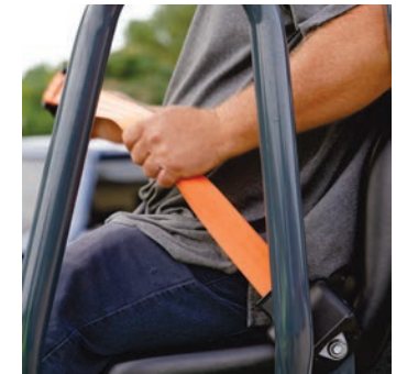
Deluxe seat with high visibility orange seatbelt and integrated side guard