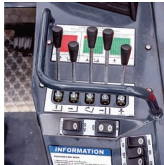
Conveniently located weather-resistant control switches