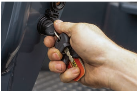
Start the engine with the ground level ignition key